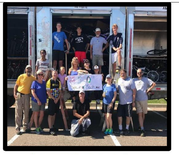
The Main Collection in Burlington