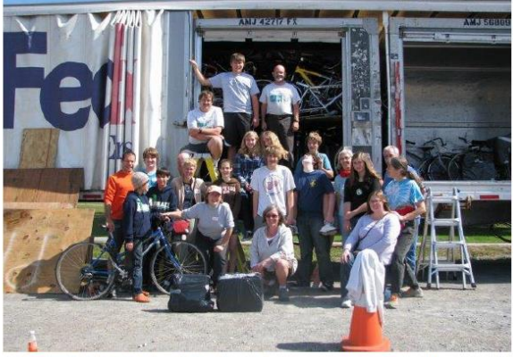
Since 1991 "Pedals for Progress" has collected and shipped over 145,000 bikes and 3000 sewing machines. Locally, we have collected over 3000 bikes and 200 sewing machines.