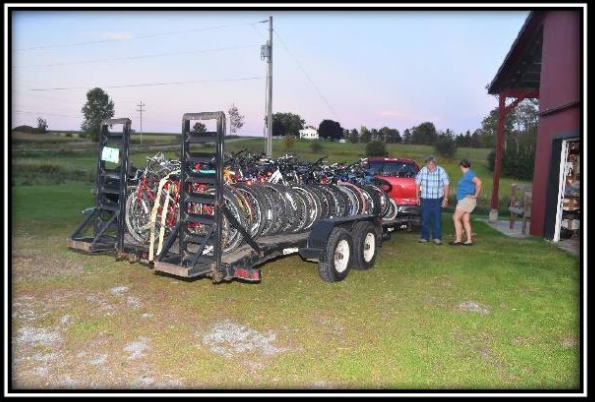
Bikes loaded on a trailer.