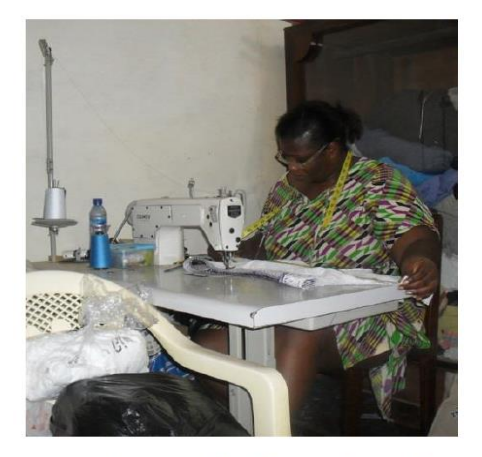
Please consider contributing to this noble cause and help provide a vital source of transportation and income to those less fortunate than ourselves.