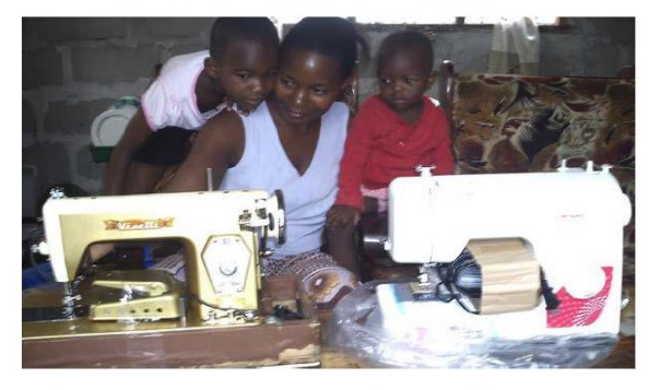
An unwanted sewing machine in the United States can be a vital source of income for a struggling family in a third world country.

Bicycles are an appropriate technology that can provide affordable, non-polluting transportation to help farmers get their crops to market, to help students and teachers greater access to regional schools, and help doctors reach patients in remote villages.