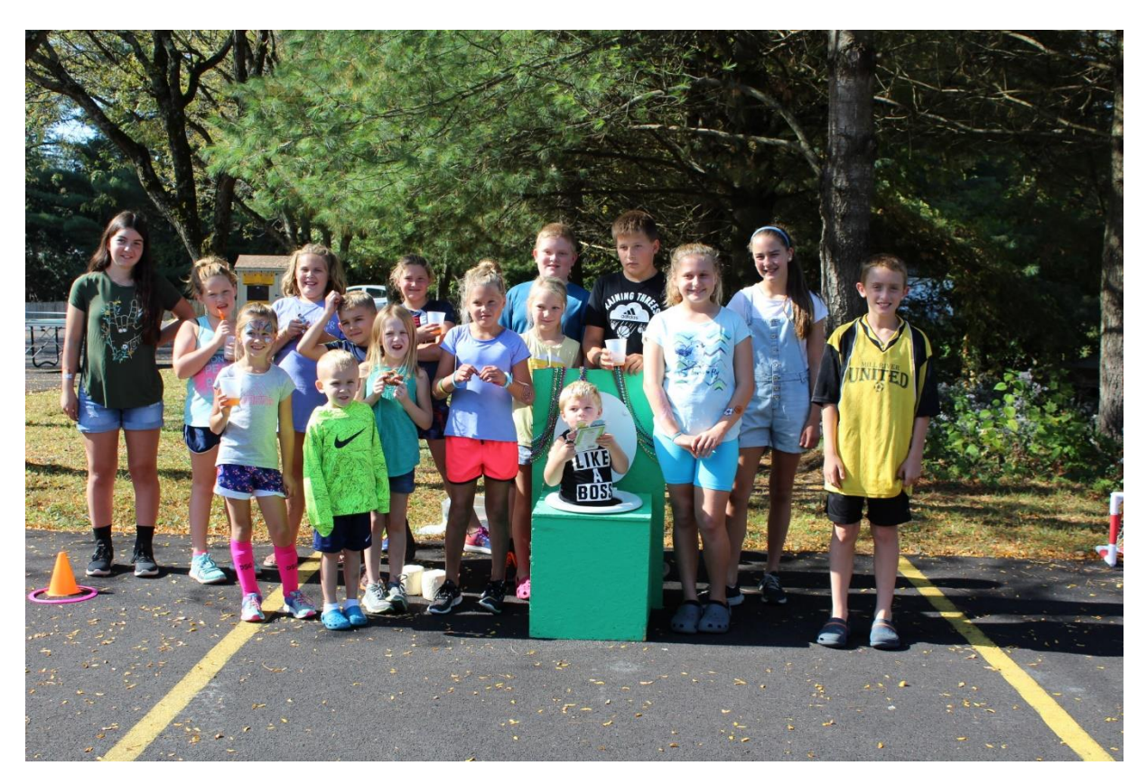
Knights of Columbus Grill Masters.